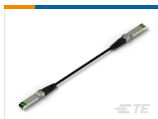
TE Part # 4-2821222-5 SFP56 DIRECT ATTACH CA, 2M, 30AWG