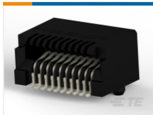
TE Part # CAT-SF59-C76264 SFP Connectors