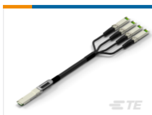
TE Part # CAT-Q17-N490333 QSFP56-Four SFP56 Cable Assembly: 26 AWG