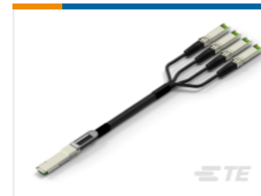
TE Part # CAT-C11-N490325 QSFP28-Four SFP+ Cable Assembly: 26 AWG