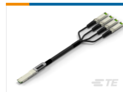
TE Part # CAT-Q17-N49011 QSFP56-Four SFP56 Cable Assembly: 30 AWG