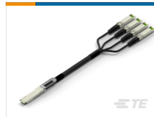
TE Part # CAT-C11-N490333 QSFP28-Four SFP+ Cable Assembly: 30 AWG