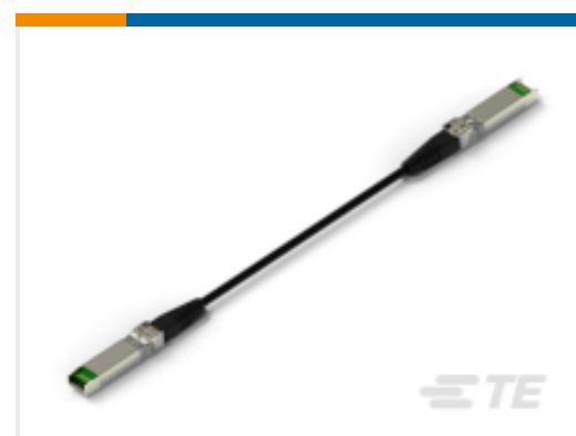
TE Part # CAT-C11-N490114 SFP28 to SFP28 Cable Assembly: 30 AWG