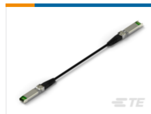
TE Part # CAT-C11-N49011 SFP28 to SFP28 Cable Assembly: 26 AWG