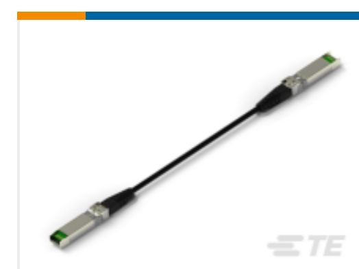
TE Part # 4-2334985-2 SFP56 DIRECT ATTACH CA, 1M, 32AWG