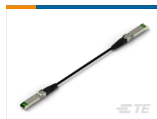
TE Part # 4-2821224-5 SFP56 DIRECT ATTACH CA, 3M, 26AWG