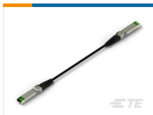
TE Part # 2334985-2 SFP28 DIRECT ATTACH CA, 1M, 32AWG