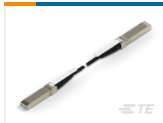
TE Part # CAT-C11-H50626 SFP+ to SFP+ I/O Cable Assembly: 30 AWG